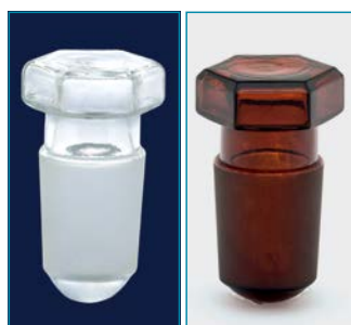
Various stoppers can be selected from cat. page no 69.