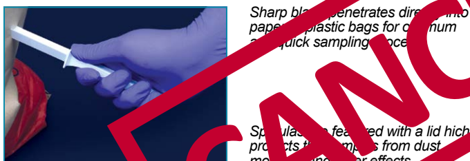
Sharp blade penetrates directly into paper or plastic bags for optimum and quick sampling process.