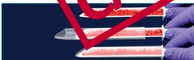
Spatulas are featured with a lid which protects the samples from dust, moisture and other effects.