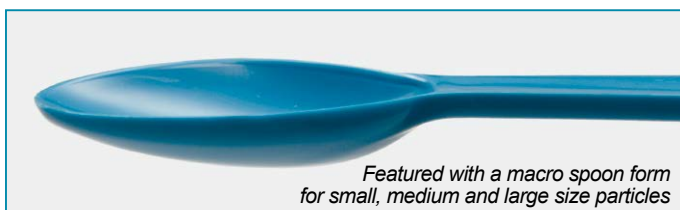
Featured with a macro spoon form for small, medium and large size particles